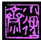
Upper left characters